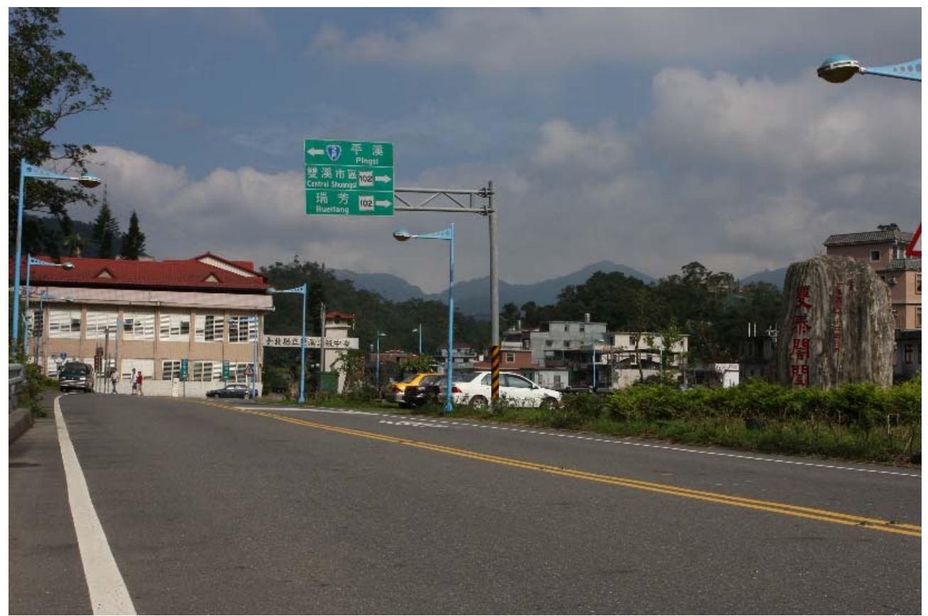
Passing by a temple and the Government Office, you'll soon reach Shuang-si Elementary school. We are here, waiting for your glorious victory!